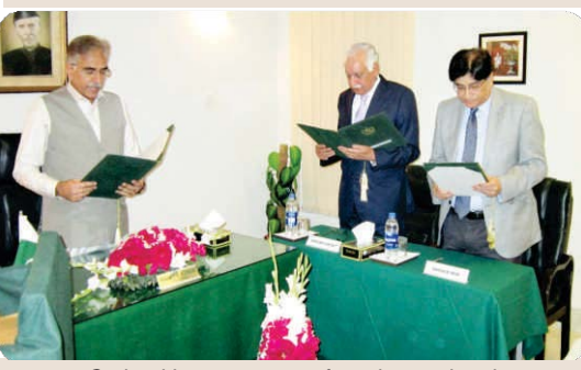
Oath taking ceremony of newly appointed Members of FPSC