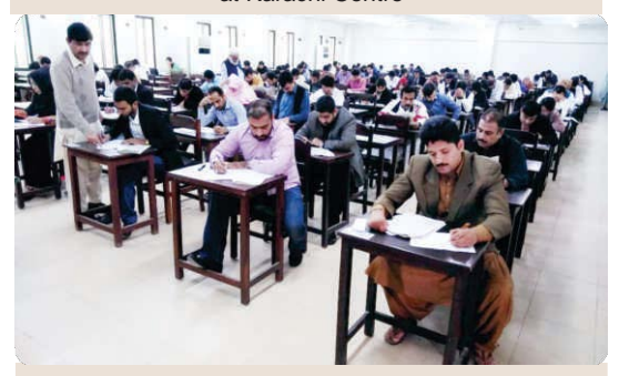
CSS Competitive Examination-2019 in progress