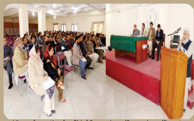
View of meeting for Chief Supervisors/Supervisors/Deputy Supervisors updating Standard Operating Procedure before conduct of examination