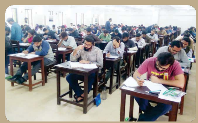
View of CSS Competitive Examination-2019, held at Karachi