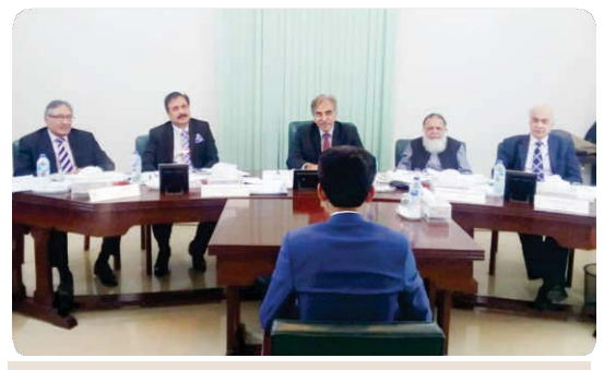
Viva Voce Board conducting Interviews for CSS-2018 at Karachi Centre