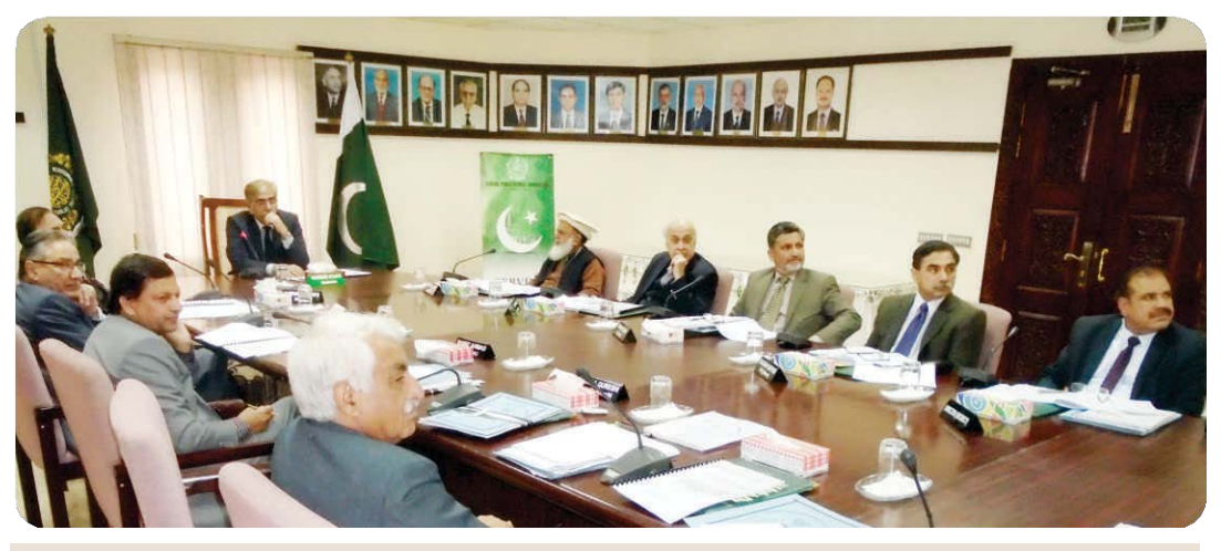
The Honourable Chairman, FPSC, presiding a meeting at conference room FPSC Headquarter Islamabad

Locations of FPSC Headquarter, 10 Provincial and Regional Offices