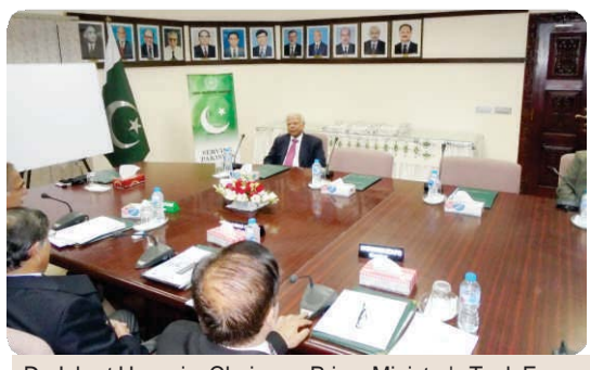
Dr. Ishrat Hussain, Chairman Prime Minister's Task Force sharing views during his visit to FPSC HQs Islamabad

The first quarter of 2019 commenced with important developments for the Commission. Highlights include visit of the Prime Minister's Task Force on Civil Service Reforms and meaningful discussion on the roadmap for recruitment and selection for the civil service. FPSC also remained engaged with the Higher Education Commission to discuss National Qualification Framework for Pakistan and to gather information on degrees available at various academic levels in all disciplines/fields of education being offered under HEC recognized universities/educational institutions. The Commission also reviewed different aspects of the recruitment, examination process and deployment of cutting edge technological solutions to meet the challenges. It was also felt that as a number of posts remain vacant /unfilled due to non availability of suitable candidates from respective quotas/fields of education, Research Wing of the Commission prepared a booklet on Qualifications/Titles/Nomenclatures of Academic Degrees as offered by HEC recognized universities/educational institutions to facilitate the process of aligning Recruitment Rules with the latest national qualifications/titles/standards. This extremely useful resource is made available on FPSC website and is also shared with all Ministries/Divisions/Departments through the Establishment Division with the request to update/revise/align respective recruitment rules as per the new standards/titles/ nomenclatures