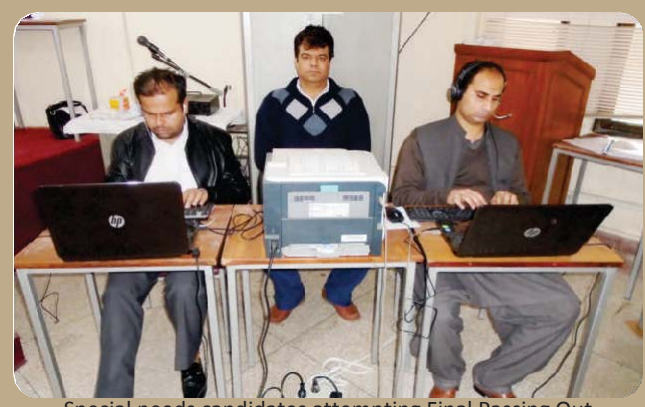
Special needs candidates attempting Final Passing Out Examinations at FPSC HQ's Islamabad