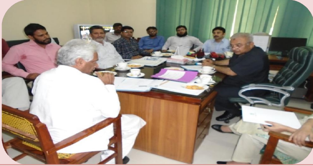
Meeting for finalizing Recruitment Rules of IT Wing held at FPSC Headquarter, Islamabad

Wing also attended the meeting. Purpose of the meeting was to finalize Recruitment Rules for IT Wing and to rationalize the roster of Human Resource at FPSC. After detailed technical evaluation of the ongoing amendments in recruitment rules, important decisions for implementation were taken.