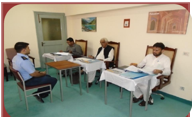
View of Psychological Assessment test of Armed Forces Officers for induction to Civil Posts.