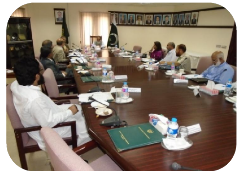
Urdu Committee meeting in progress