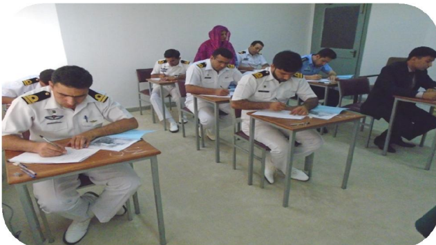
Psychological Assessment in progress