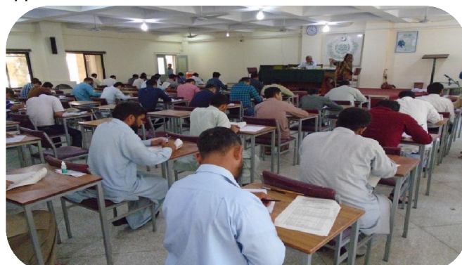
Recruitment Test Phase- IV/2017 at FPSC Headquarter, Islamabad

The Commission conducted Professional / Screening / Descriptive Tests/Shorthand Typing APS Tests (Phase-IV/ 2017) for ex-cadre posts in BS-16 and above from 13.08.2017 to 25.08.2017 respectively at Islamabad, Karachi, Lahore, Peshawar, Quetta, Multan, Sukkur, D.I.Khan, Gilgit and Skardu. Out of 162871 registered candidates, 96850(59.46%) appeared in these tests.