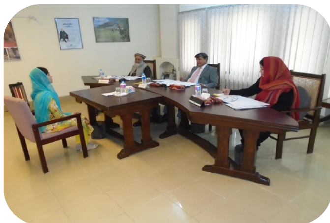
Committee of the Commission conducting Interviews at FPSC Headquarter, Islamabad