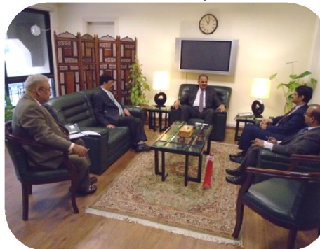
Chairman, FPSC meeting the Bangladesh delegates