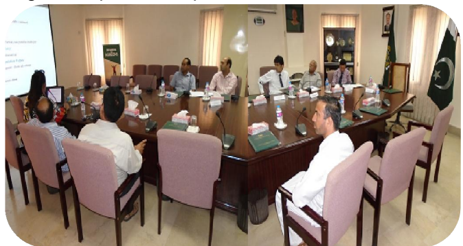
Meeting with print media Advertising Agencies