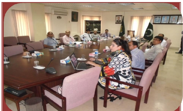
View of Meeting on Selection/Competition of advertising agencies at FPSC HQs Islamabad