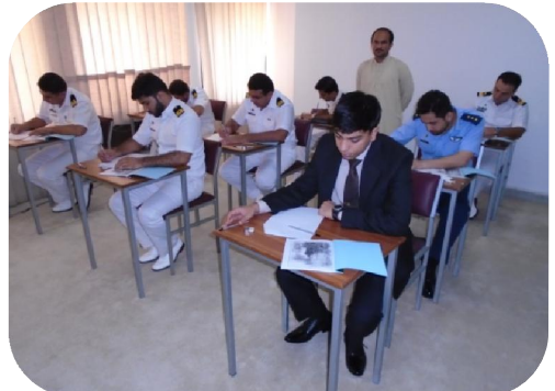
Psychological Assessment at FPSC HQs. Islamabad