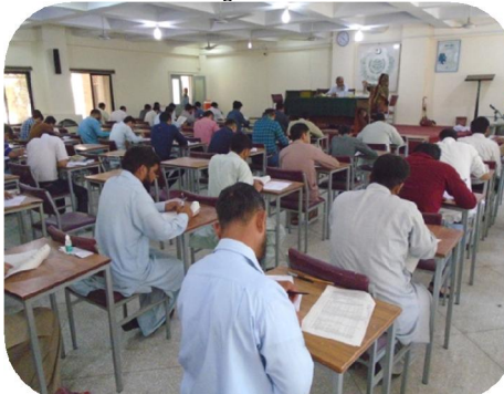
General Recruitment Test Phase- IV/2017