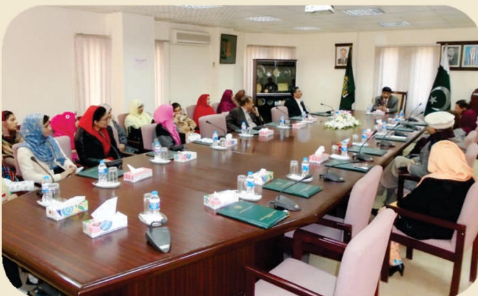
View of National day for Working women organized at FPSC HQ's Islamabad on 22.12.2017.