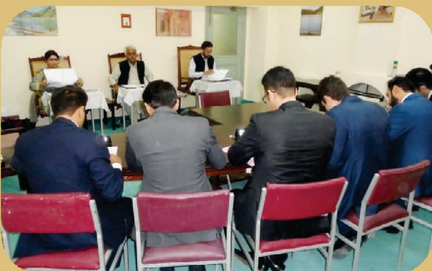
View of Psychological Assessment group activities of written qualified candidates CSS-2017.