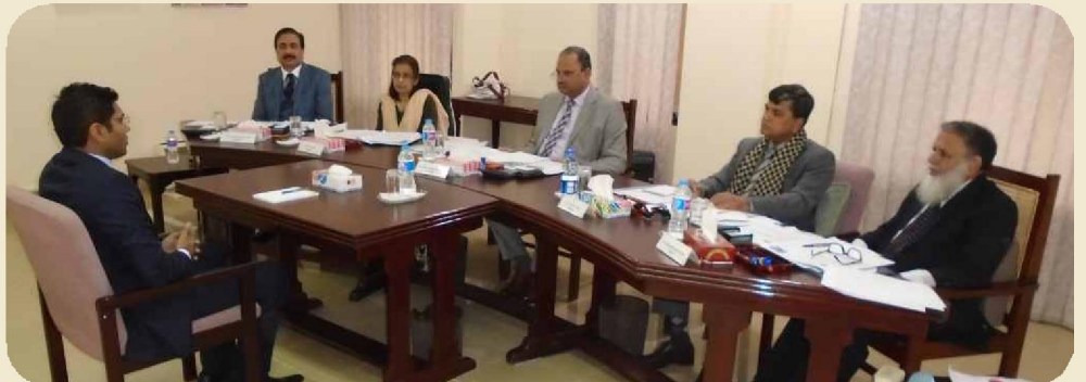
Viva Voce Board conducting viva voce for CSS-2017