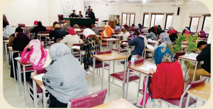
Recruitment Test Phase-V/2017 at FPSC Headquarter, Islamabad

The Commission conducted Professional / Screening / Descriptive/Shorthand Typing APS Tests (Phase-V&VI/ 2017) for ex-cadre posts in BS-16 and above from 15.10.2017 to 25.10.2017 & 10.12.2017 to 19.12.2017 respectively at Islamabad, Karachi, Lahore, Peshawar, Quetta, Multan, Sukkur, D.I.Khan, Gilgit and Skardu. Out of 27,748 registered candidates, 13,508(49%) appeared in these tests.