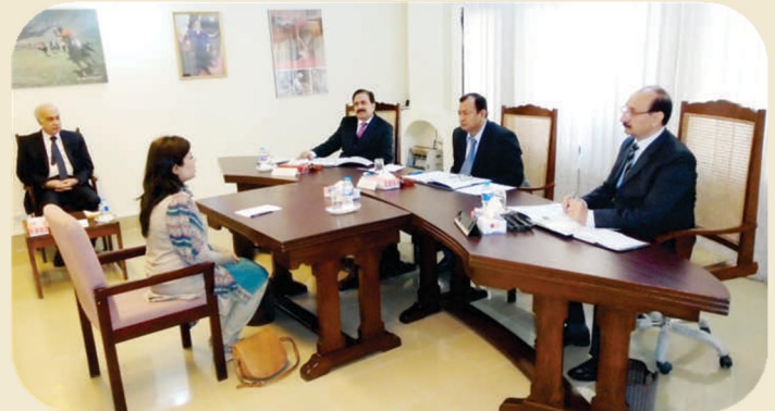
Committee of the Commission conducting Interviews at FPSC Headquarter, Islamabad