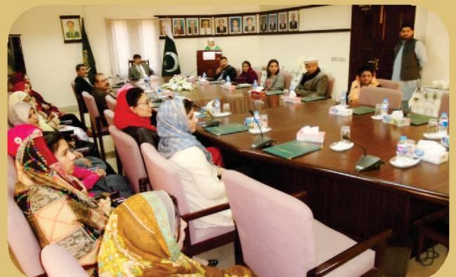
National day for Working Women celebrated on 22.12.2017 at FPSC HQ's Islamabad