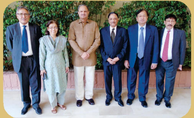
Group View of Chairman & Members of the