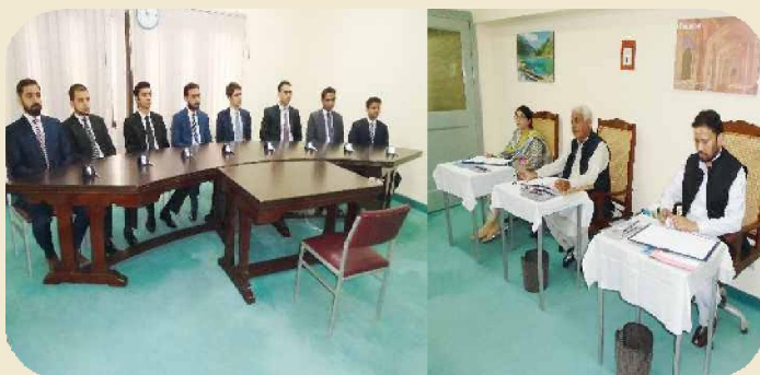
View of Psychological Assessment group activities