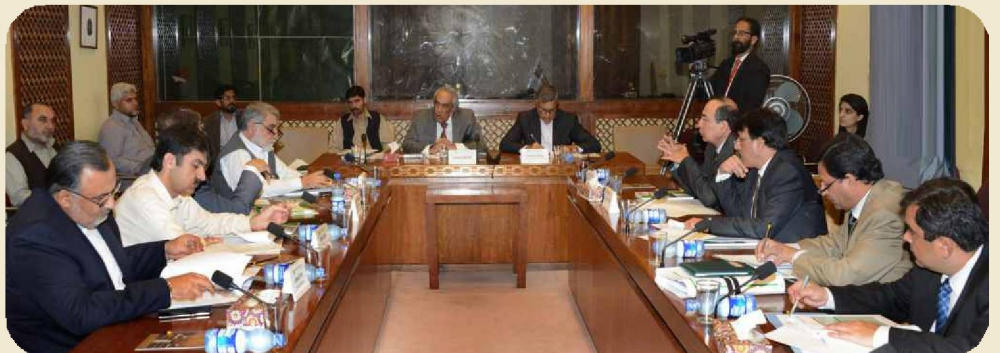
Senate Special Committee Meeting held to examine FPSC Annual Report-2015